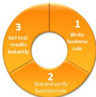
3 Step Automation Based Process - 3 Minutes per Iteration

By contrast, Kapow Content Migration eliminates these unnecessary processes by allowing you to “verify as you build” with actual content sources - giving you the confidence of knowing your migration will be accurate, predictable and on-time.