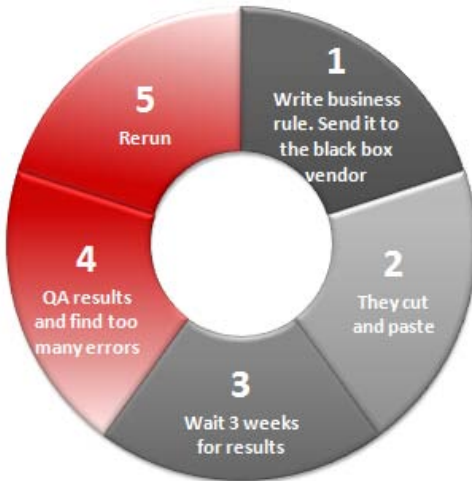
5 Step Manually Based Process - 3-4 Weeks per Iteration

To remedy this problem, black box approaches impose lengthy and cumbersome layers of process upon you, trying to catch the errors and make up for deficiencies in their manual based methods. You are expected to repeat the process of giving them your specifications and your data, then wait for the results, then verify the results, and then specify what went wrong and once again, start the process all over again and again and again. Sooner or later you run out of time, money and resources leaving your migration incomplete.